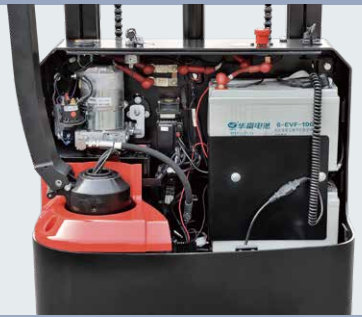
Fully opened hood, easy accessibility of all components, is easy for service