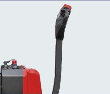
Simple and beautiful tiller designed to improve the operator’s driving comfort