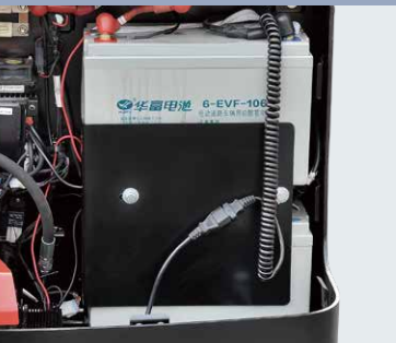
Built-in charger and maintenance free gel battery, you don’t need to worry about them